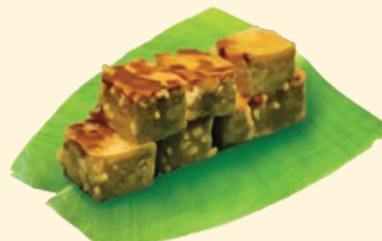
Lagan Nu Custard