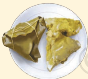
Patara ni Machhi