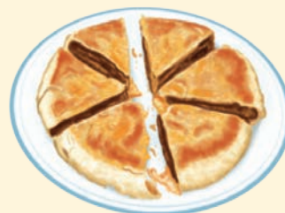
Dar ni pori